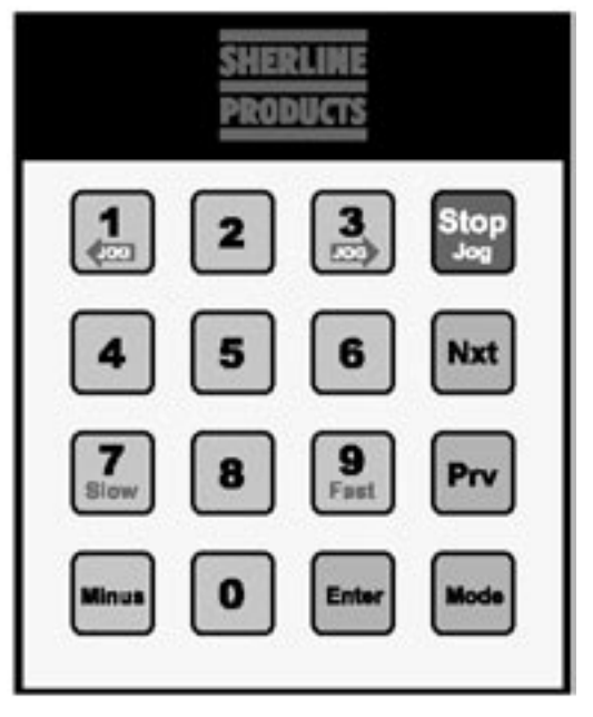
Figure 2—Layout of the keypad