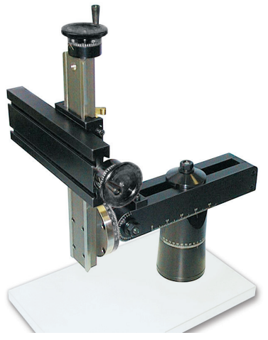
P/N 6570 Manual version shown. (White base not included.)